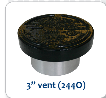
3" vent (244O)