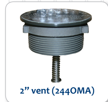
2" vent (244OMA)