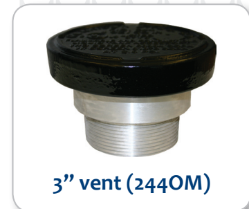
3" vent (244OM)