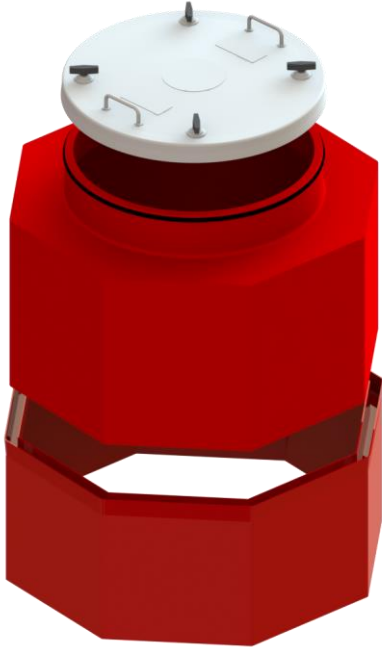
Product Shown B423-60-S-01