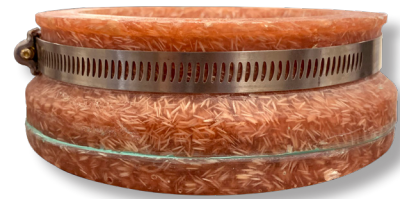
Round Wall SRB PF-SRB-1R-R4