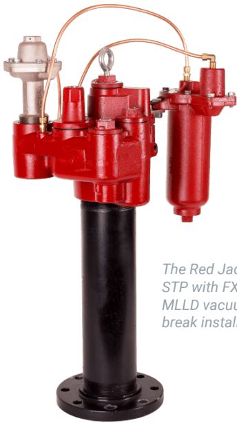
The Red Jacket STP with FXV MLLD vacuum break installed.