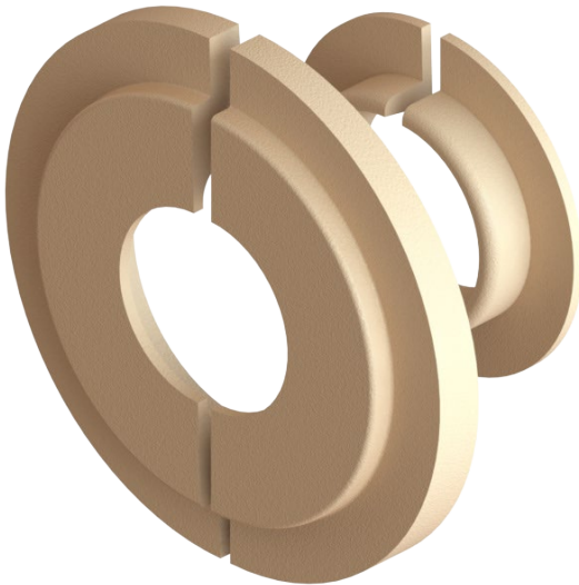
Product Shown RF-20-05-F