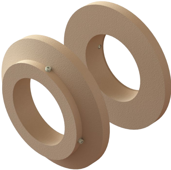
Product Shown F-30-F