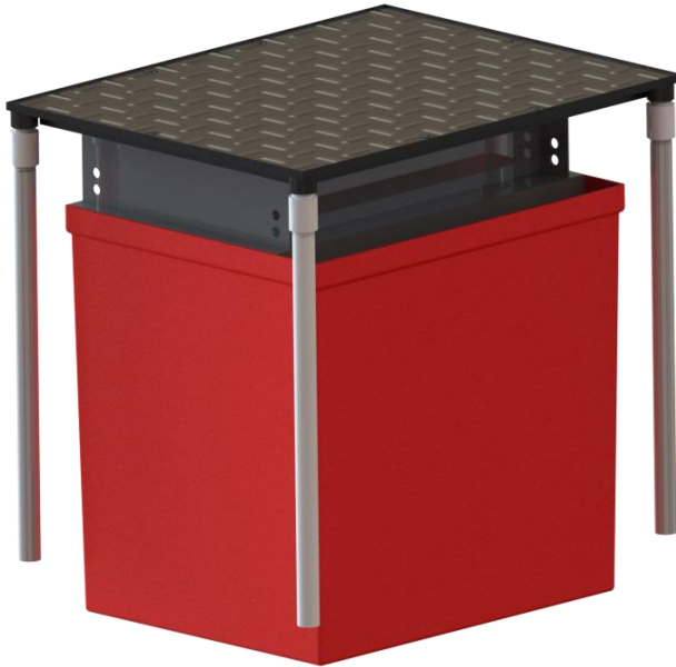
Product Shown B701-S