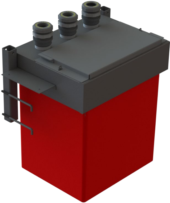
Product Shown B501-S