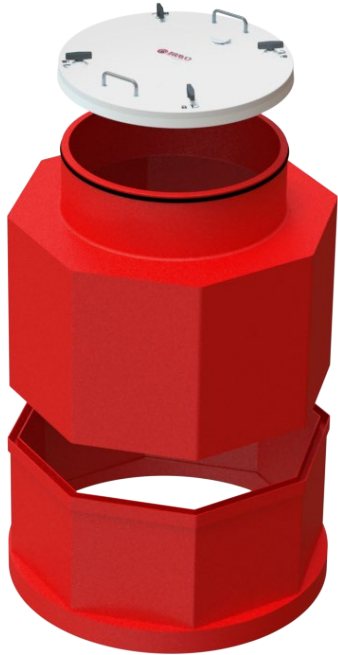
Product Shown B421-60-S-01