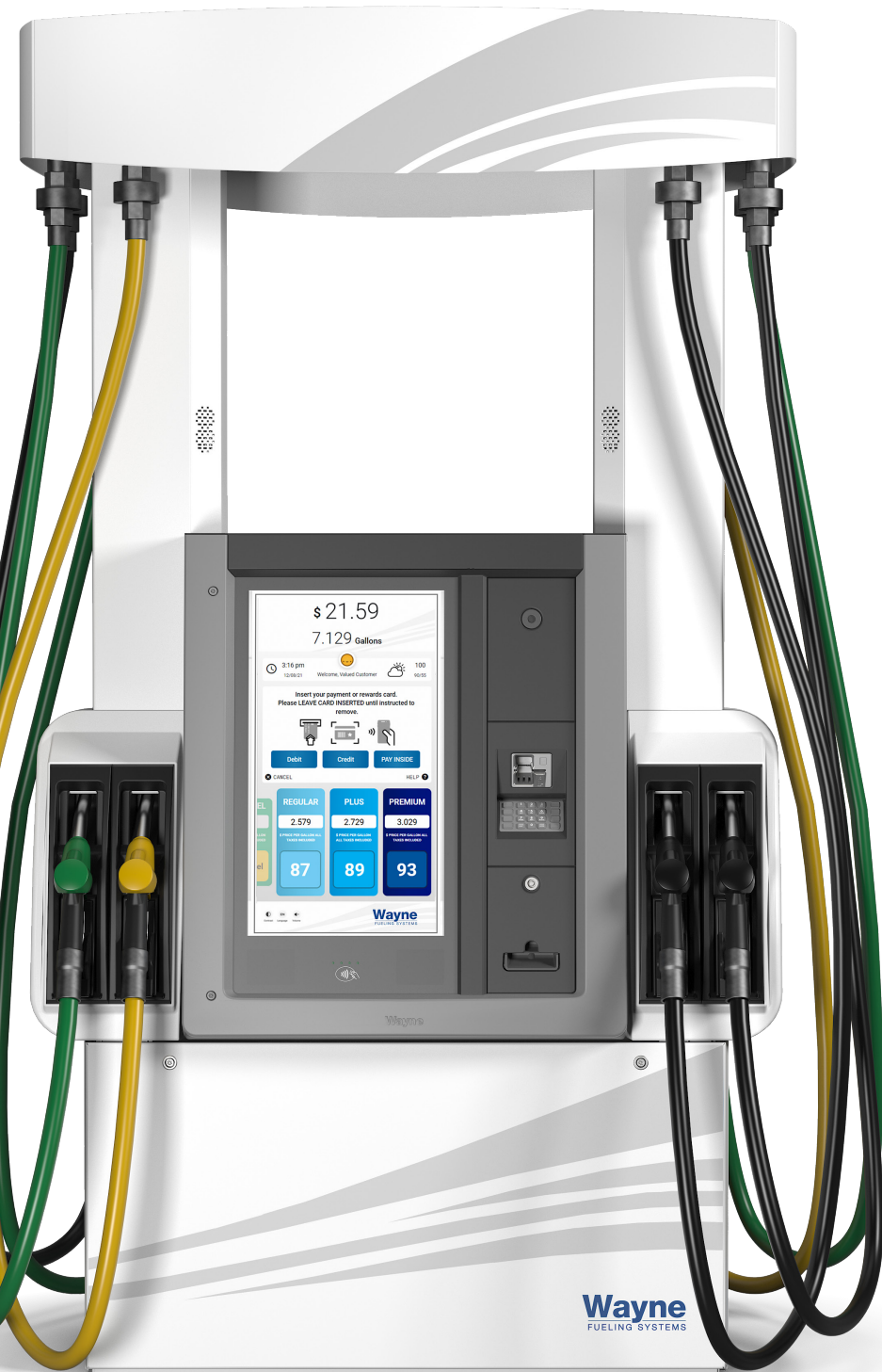
Wayne Ovation® Multi-hose fuel dispenser