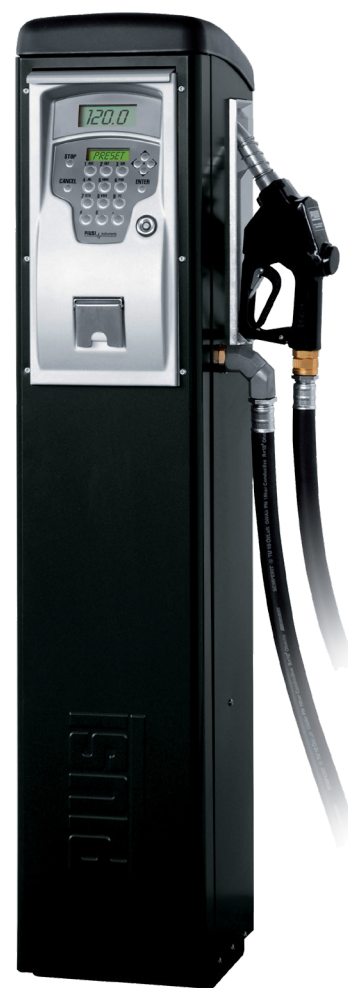
SELF SERVICE FM 2.0