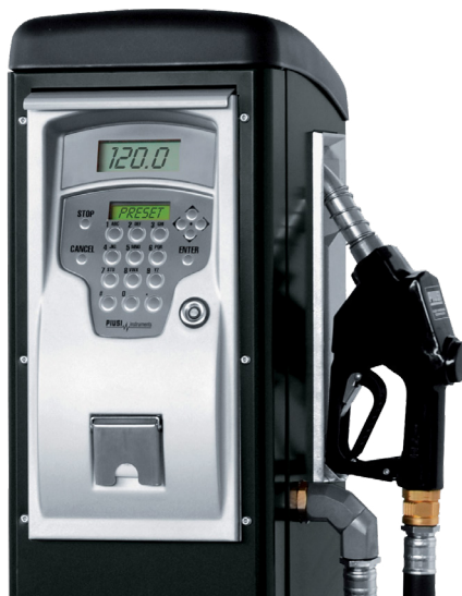
INTEGRATED TICKET PRINTER