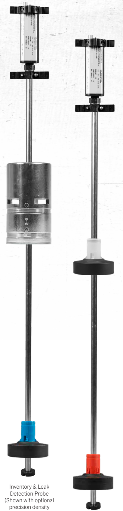
Inventory & Leak Detection Probe (Shown with optional precision density diesel float kit)